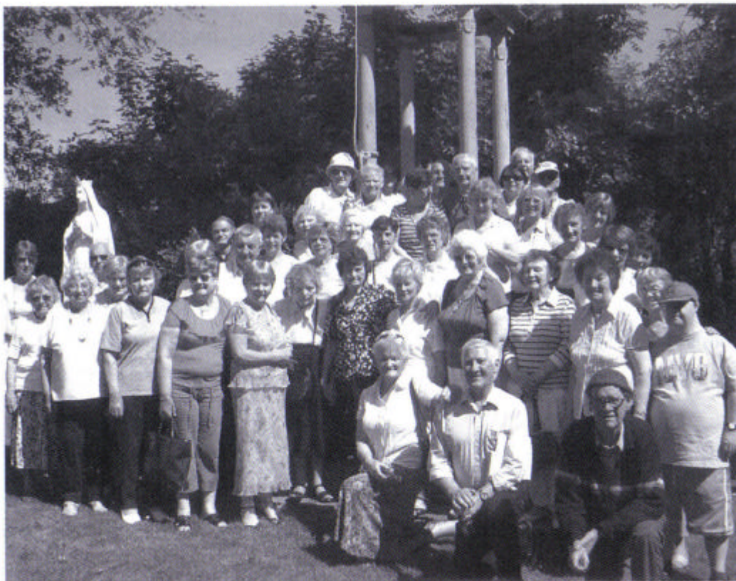
Parishioners of St Mary's visited the Addergoole Titanic Memorial last year.

on behalf of the Addergoole Titanic Society